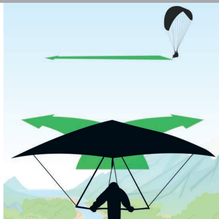
Converging course: The aircraft that has the other on its right must give way.