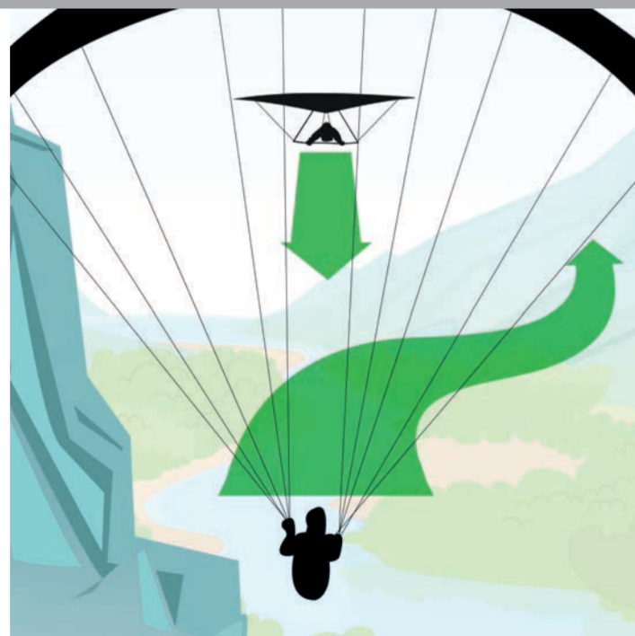
Ridge soaring: The glider with the ridge on his or her left should give way.

In Europe there are currently no legally binding rules specific to thermal flying and ridge soaring for paragliders and hang-gliders. The European Hang Gliding and Paragliding Union (EHPU) has therefore summarised the most important common rules which are valid in all countries. It should be noted however, that in some countries the rules for thermal flying and ridge soaring can only be regarded as a recommendation of the national federation, not as a legal requirement. In general, the EHPU recommends that when flying abroad, you should consult the websites of the national pilot federations for information on the flight rules.