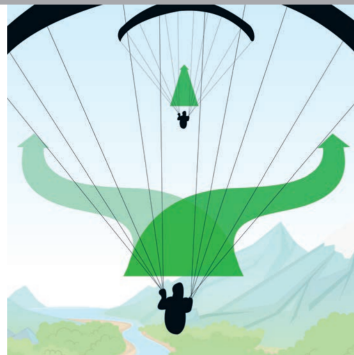
Overtaking: Overtake to the right at a safe distance. Overtake to the left only if right is not possible. The glider being overtaken has right of way.