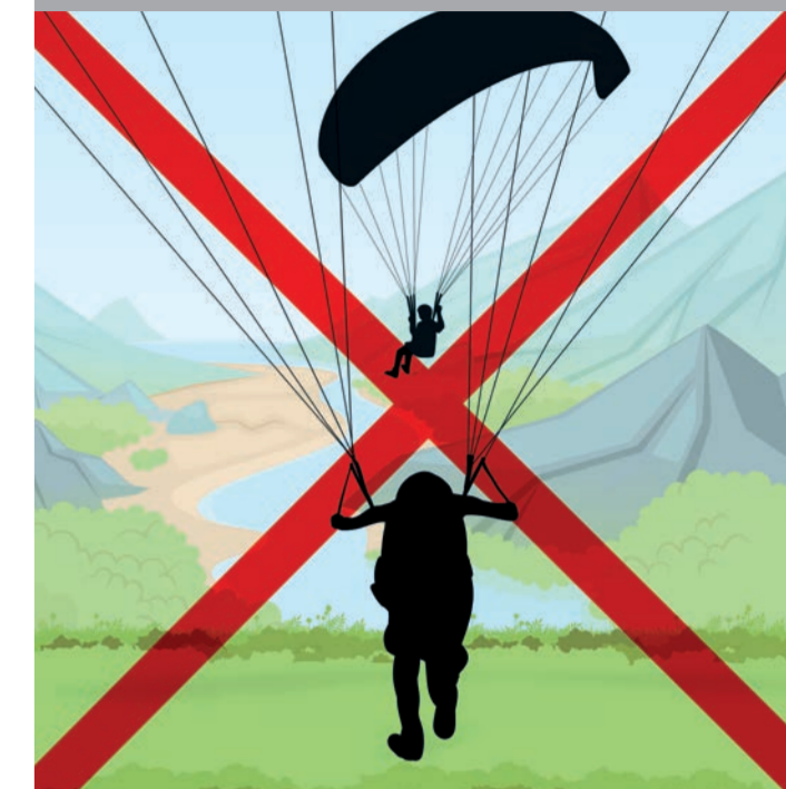
Launch: Only take off if the airspace is clear and there is no risk of a collision.