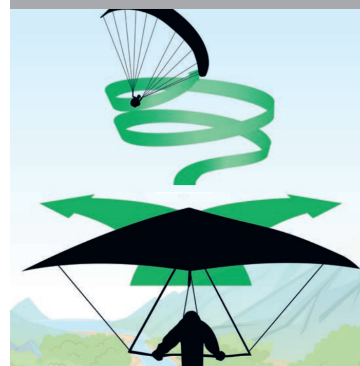
Thermalling: Gliders circling in a thermal should be avoided. Note: On a slope or ridge, the ridge flying rules have priority.