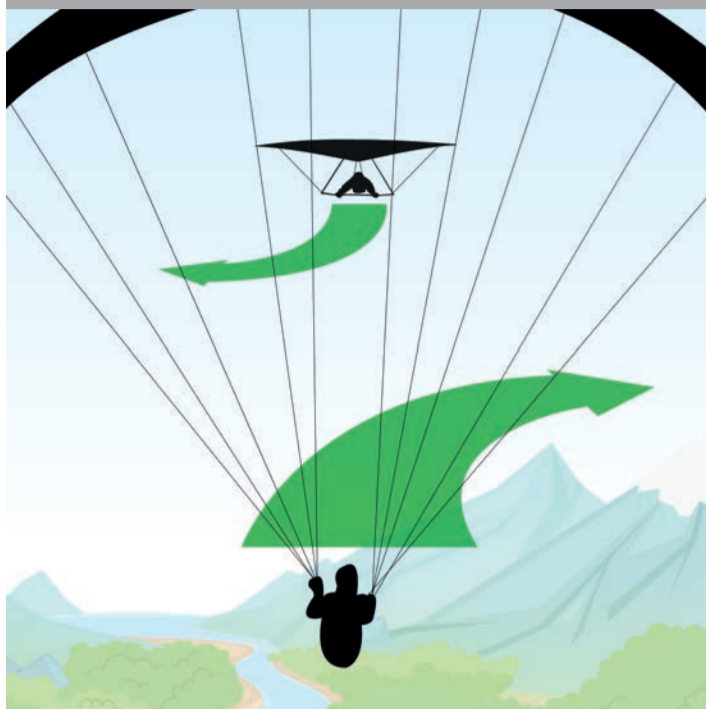
Head-on course: Both aircraft alter course to the right.