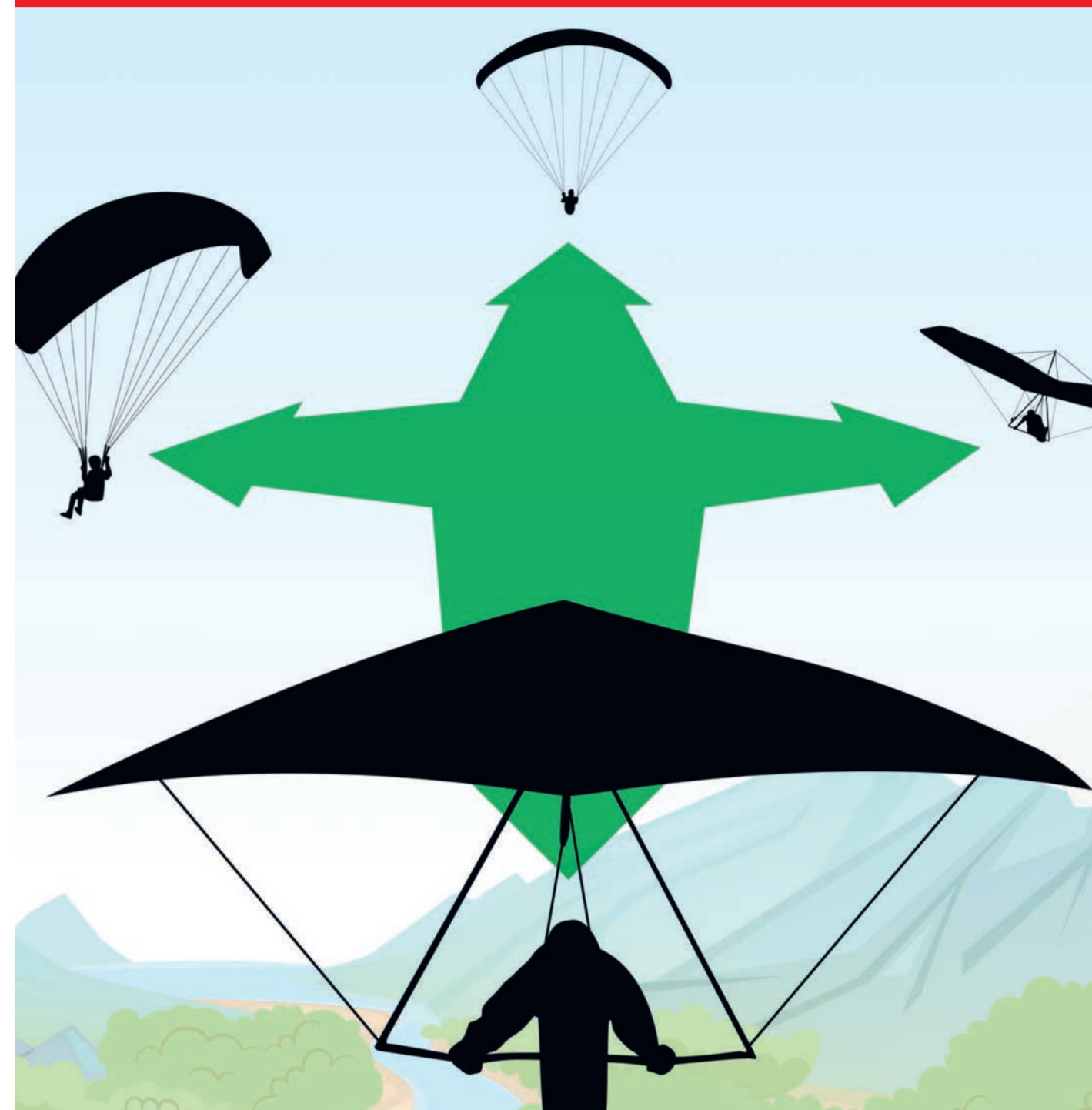
Basic rule: Do not intentionally fly close to other aircraft so as to cause a risk of a collision.