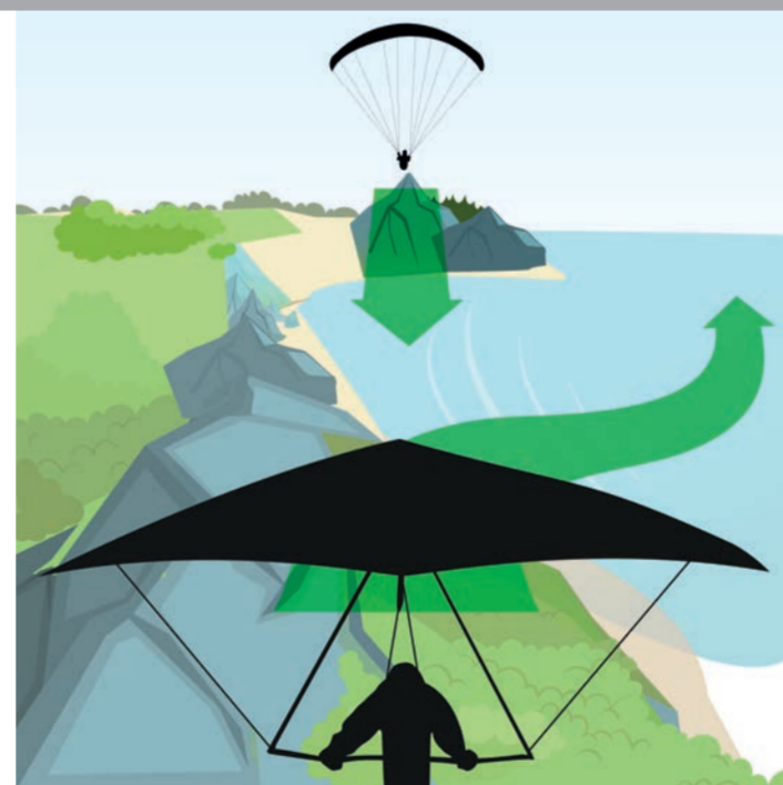
Soaring above the ridge: The glider with the Lee to the left should give way to the right.